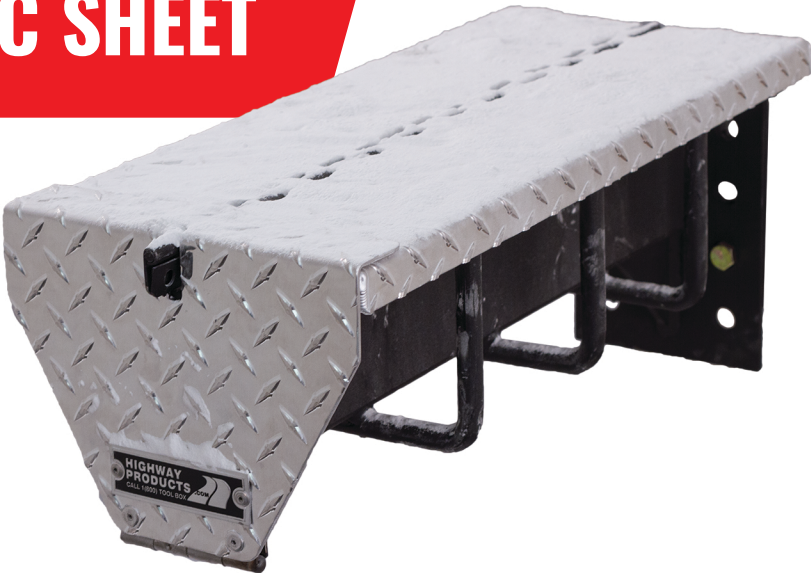
1821-007 Diamond Plate